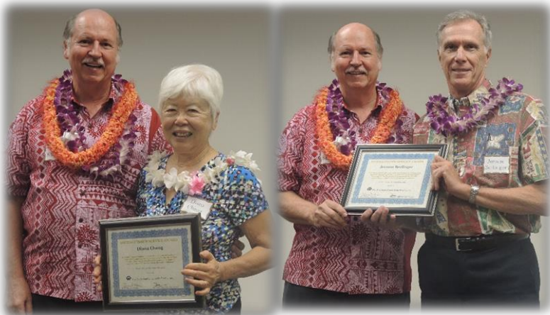
Diana Chang & Jerome Berlinger Distinguished Service Award