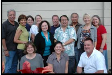
Advanced Mediation November 2011

In 2011, the Mediation Center provided a total of 112 hours of trainings and workshops to ensure that high quality services are maintained.