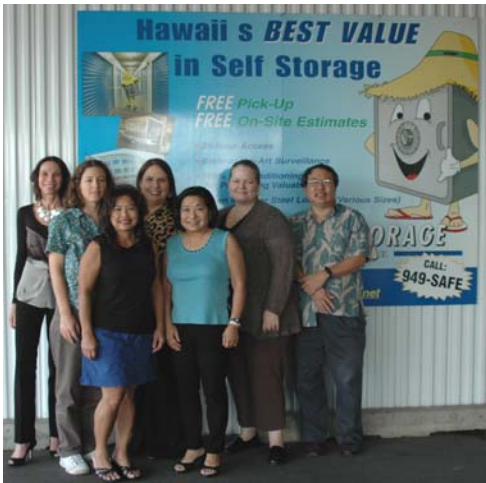
The Mediation Center is grateful to Hawaii Self Storage for the free storage unit in Pearl City.

Exactly three years ago the Mediation Center had the good fortune to become part of the Harry & Jeanette Weinberg Kukui Children's Center. Since that time we have enjoyed collaborating with fellow tenants to better serve the community and have benefitted from many wonderful opportunities made possible through the Community Partners Program (CPP) that was created by the Kukui Children's Foundation. Through this innovative program, donations of goods and services, as well as volunteer efforts, enable the organizations to work more efficiently, focus their resources on core services and serve even more children and families.