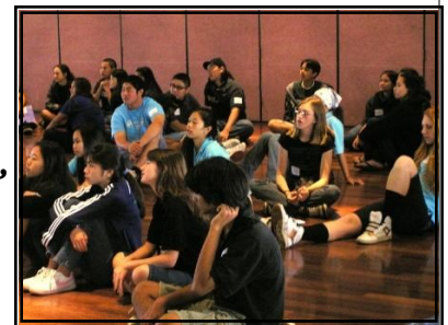
Students from 5 of the participating schools agreed to coordinate a joint follow-up training over the summer.

On March 9th, the 22nd Annual Statewide Peer Mediation Conference, Relationships, Making Them Work , was hosted at the Ala Wai Golf Course Club House. More than 100 students from 10 middle, intermediate and high schools from the islands of Hawai'i, Kauai, Maui and Oahu, participated. 90% of the students reported that participation in the conference helped them to improve their skills as mediators.