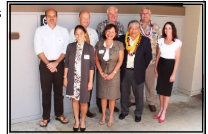
The Access to Justice Summit was held on Wednesday, June 24th at the William S. Richardson School of Law

EPIC, Inc. & The Mediation Center provided 5, 3-hour sessions on Conflict Resolution, Mediation and Facilitation for 20 members of the Keolahou Youth Group and other members of the Waimanalo Community. Additional sessions throughout the remainder of 2009 will focus on O'hana Conferencing and Youth Circles.