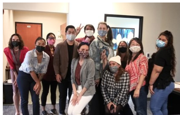
The MCP Team dresses up for a Decades Day, showcasing fashion from the 70s, 80s, and 90s.

Yoko Ono said, "Spring passes and one remembers one's innocence. Summer passes and one remembers one's exuberance. Autumn passes and one remembers one's reverence. Winter passes and one remembers one's perseverance." Perseverance was unquestionably required on everyone's part last winter and over the past two years. It is only through the perseverance of the MCP Board of Directors, Board of Advisors, mediators, funders, partners, and staff, that MCP was able to address the huge wave of need generated by the pandemic. And while it will require continued perseverance to maintain the consistent high level of services, it is time to welcome Spring, renew our spirit, and celebrate together!